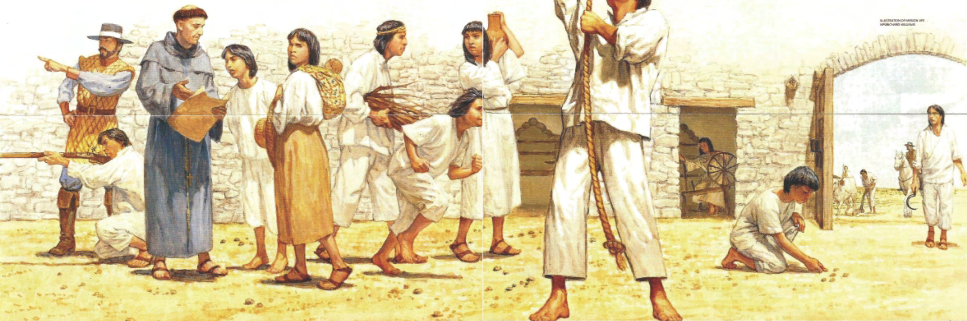
ILLUSTRATION OF MISSION LIFE MURPHY/WORD WELLS