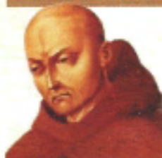
Fray Antonio Margil de Jesús (1657–1726), founder of Mission San José.

Cross and Crown Spanish colonialism, like that of other nations then, was exploitative. Yet the Franciscans directed these missions with a gentle hand. An order of friars whose members took vows of poverty, chastity, and obedience, the Franciscans pledged to serve as protectors of the Indians. They also helped the Crown as explorers,